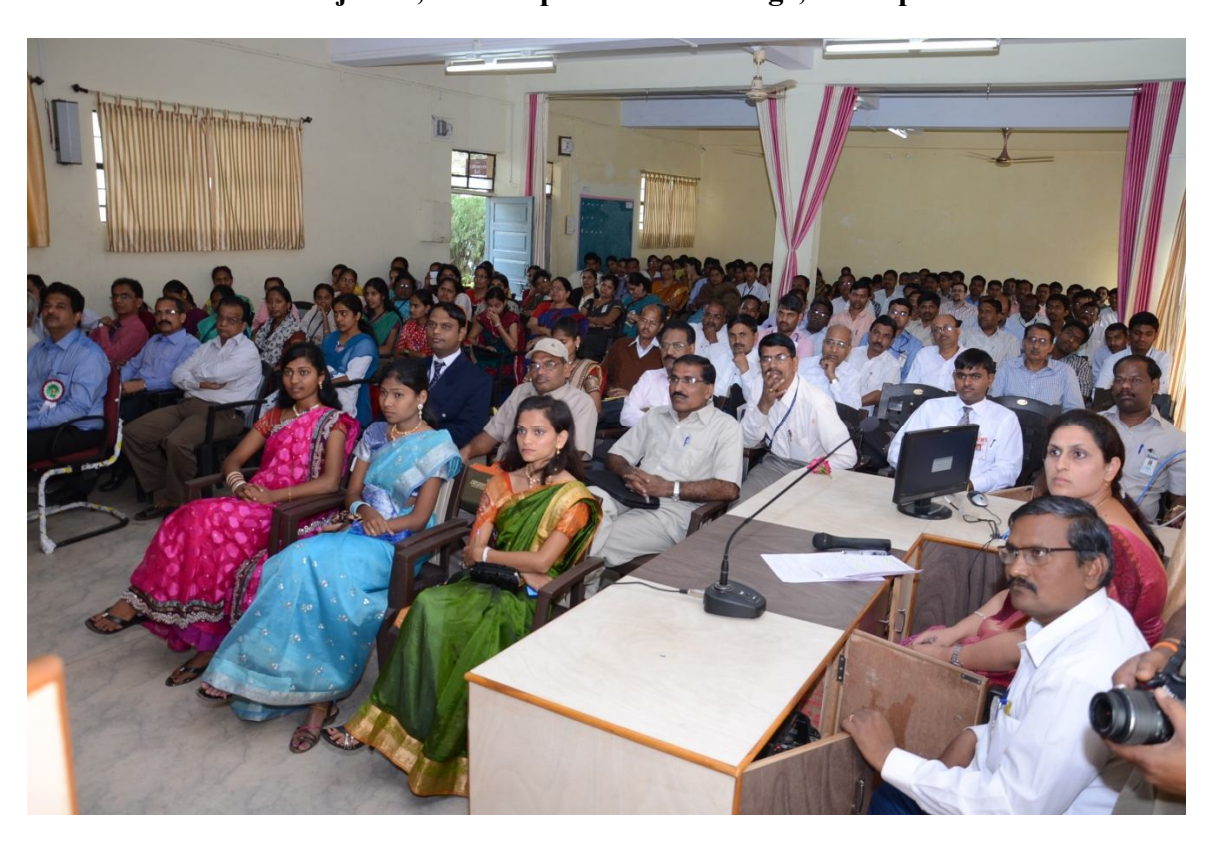
Delegates and Participants